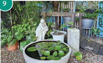
4 Kenilworth Street, Maryborough

Serenity is an immersive experience with a mixture of newer and established areas that express the character of the owners. Each area has a unique theme to delight visitors.