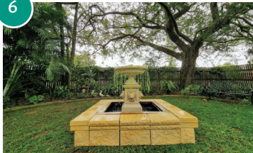
20 Katherine Street, Maryborough

These mature gardens have a wonderful shade canopy for the hot summer days and to provide shelter for a variety of under storey plantings. Exploring the gardens will show a mixture of native and tropical plants interspersed with beautiful statuary.