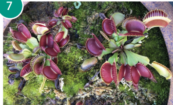
49 Grosvenor Street, Maryborough

This suburban garden is 20 years old. Established from a blank canvas all those years ago to where the owners have built it to today. Plant sales will be held during the Open Garden Day and fundraising will be held for To The Nations Charity.