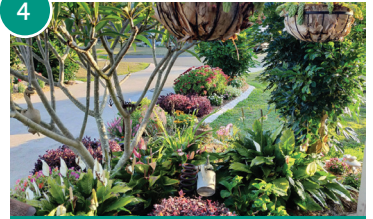
12 Poincianna Court (Tinana), Maryborough

Colour and quirkiness abounds in this garden. A garden path bordered with brightly coloured and fragrant flowers is a delightful welcome for garden visitors. Follow the path to an exciting garden crammed with many forms of recycled and quirky garden art made by the garden owner.