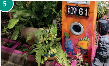
6 Katherine Street, Maryborough

A whimsical garden full of colour and creativity. Although most of the garden is less than a year old, it already captures the beauty of nature in a vibrant and expressive way and attracts an abundance of butterflies, bees and bird life. This garden is full of joy.