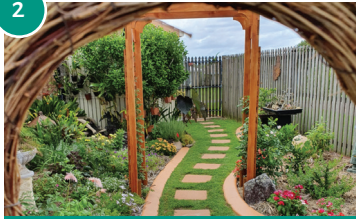
3 Frangipani Close, Tinana

The owners introduced a diverse and interesting variety of shrubs and plants. The garden has been split into small garden rooms featuring bonsais, desert roses, cacti, succulents, ferns and roses. Pottery and plants sales available.