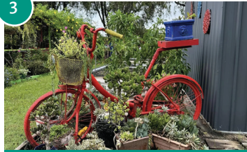
Lupton Park Community Gardens, 45 Aberdeen Ave, Maryborough

Established in 2014, Lupton Park Community Gardens is celebrating their 10th anniversary. The gardens have grown from a bare block into a unique space for growing organic food, sharing ideas, and fostering community friendships.