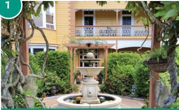
Stirling, 14 North Street, Maryborough

Your visit is a celebration to the grounds and gardens that were initially established over 140 years ago. Evolving over time, enhancements and plantings provide enchantment and grace.