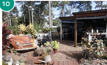
21 Hoffmann Street, Maryborough

This is a new garden with many features including a dry creek bed, outdoor cookhouse, fire pit, the old Morrie, a truck bar and shade houses.