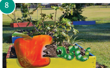
The Hut Food Forest, Cnr Raglan & Banana Streets, Cranville

Maryborough Garden Club have designed and built a food forest, with recycled elements, compost, worm farms wicking beds and a community herb garden. A recycled clothes hoist frame sits majestically for the hanging garden.