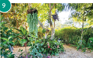
13 Arthur Street, Maryborough

This private Rainforest Retreat has pathways and seating areas and lush views around the orchard and deck area. The owner is a keen permaculture gardener who loves to grow things from seed. She has a composting system and she makes her own soil.