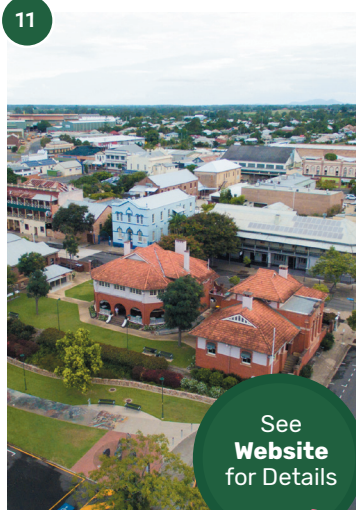
Portside, Wharf St, Maryborough

Soak up history against a backdrop of glorious colonial architecture and riverside parklands as you explore Maryborough's original port district.