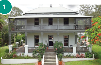
Baddow House, 366 Queen Street, Maryborough

We are very privileged to have historic Baddow House as part of the 2023 Maryborough Open Gardens with parts of the house open to the public as well as the gardens. Built in 1883 Baddow House is a Maryborough Landmark.