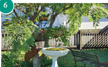
12 Poincianna Court, Tinana

Colour and quirkiness abounds in this garden. A garden path bordered with brightly coloured and fragrant flowers is a delightful welcome for garden visitors. Follow the path to an exciting garden crammed with many forms of recycled and quirky garden art.