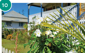
268 Albert Street, Maryborough

This garden perfectly frames a Queenslander home and will delight visitors with the range of flowers and shrubbery that is very much a work in progress for this young garden.