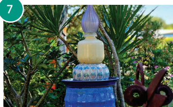
6 Katherine Street, Maryborough

A whimsical garden full of colour and creativity. Although most of the garden is less than a year old, it already captures the beauty of nature in a vibrant and expressive way and attracts an abundance of butterflies, bees and bird life.