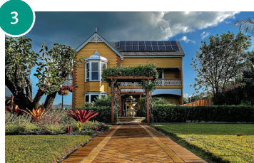
Stirling, 14 North Street, Maryborough

The grounds and gardens were established over 140 years ago. Evolving over time, enhancements and plantings provide enchantment and grace – a stunning and befitting landscape for the magnificent house.