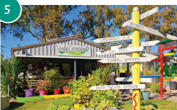
Lupton Park Community Gardens, 45 Aberdeen Ave, Maryborough

A unique and innovative space created by the local community. Ideas generated and organic food grown on site is shared amongst caring volunteers and with community.