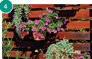
3 Frangipani Close, Tinana

This garden is 3 years old with a diverse and interesting variety of shrubs and plants. The garden has small garden rooms featuring bonsais, desert roses, cacti, succulents, ferns and roses. Greenhouses, a wall feature and creative pottery and artwork will delight.