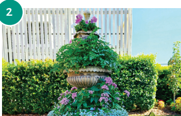
Mary's Garden, The Story Bank, 331 Kent Street, Maryborough

Mary's Garden at The Story Bank is a place where you can let your imagination run free. Explore the pocket park and search for hidden treasures to see how many different types of herbs, flowers or creatures you can find.