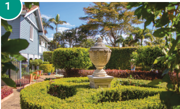
9 Elizabeth Street, Maryborough