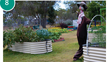
Lupton Park Community Gardens

Located at 45 Aberdeen Avenue Maryborough, the Lupton Park Community Garden is a not-for-profit community based enterprise which produces organic food primarily for the consumption of the gardeners.