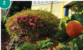
296 Lennox Street, Maryborough

This garden is at one with the Queenslander nestled within. Mature trees and palms provide the canopy for a diverse range of plantings. Winding paths will lead you on a journey of discovery through azaleas, citrus and potted plants.