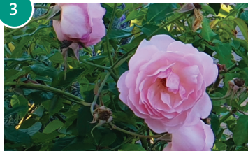
14 North Street, Maryborough

The garden at Stirling dates back more than a hundred and forty years. The oldest surviving specimen is a giant, gnarled frangipani, which provides welcome shade in the hottest months. Stirling is a garden not to be missed.