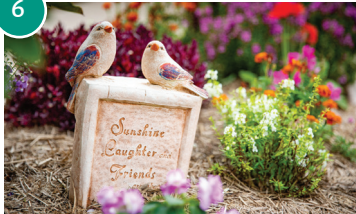
12 Poincianna Court, Tinana

Colour and quirkiness abounds in this garden. A garden path bordered with brightly coloured and fragrant flowers is a delightful welcome for garden visitors.