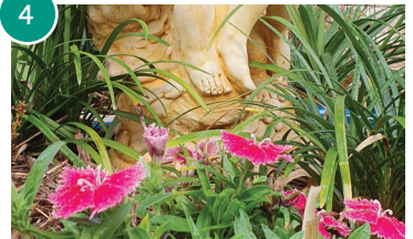
79 Cheapside St, Maryborough

Serenity is the name of this eclectic garden which is full of colour and surprises around every corner.