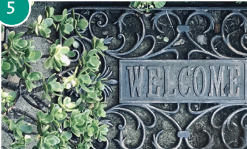
250 Pallas Street, Maryborough

This lovely garden has a traditional Queenslander nestled within it, and has an abundance of quirky garden art in various mediums including glass, metal and wood. Plantings are very diverse and provide a haven for bees and bird life.